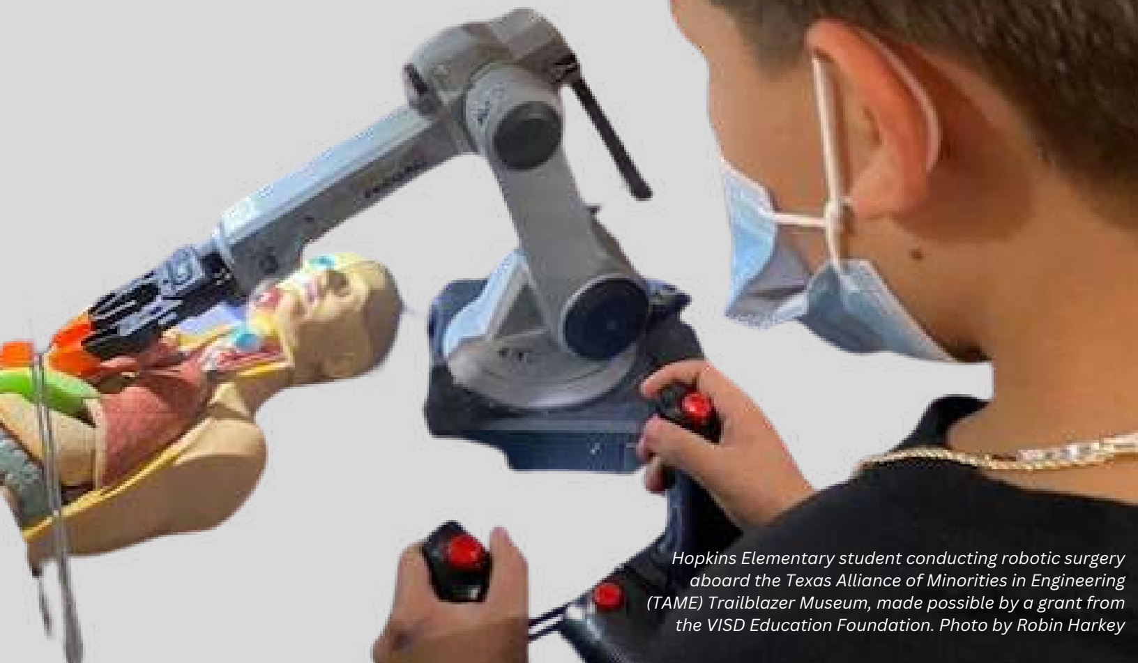
Hopkins Elementary student conducting robotic surgery aboard the Texas Alliance of Minorities in Engineering (TAME) Trailblazer Museum, made possible by a grant from the VISD Education Foundation.

Annually we impact between 5,000 and 10,000 students through hands-on, STEAM (science, technology, art, engineering, and math) project-based learning through our Grants for Great Ideas initiative and support dual credit scholarships and senior scholarships to students in Victoria ISD. Our bottom line seeks to advance the career trajectory of students in a district in which 70% are categorized as economically disadvantaged (Title I data, 2022-2023).