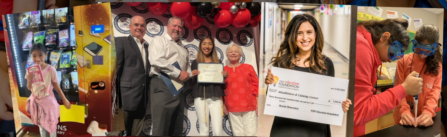
Grants for Great Ideas - Dual Credit - Senior Scholarships & More

Annually we impact between 5,000 and 14,000 students through hands-on, STEAM (science, technology, art, engineering, and math) project-based learning through our Grants for Great Ideas initiative and support dual credit scholarships and senior scholarships to students in Victoria ISD. Our bottom line seeks to advance the career trajectory of students in a district in which 69% are categorized as economically disadvantaged (Title I data, 2021-2022).